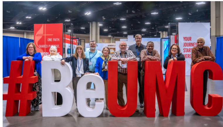
Photo Of Eastern PA Delegates To General Conference 2024