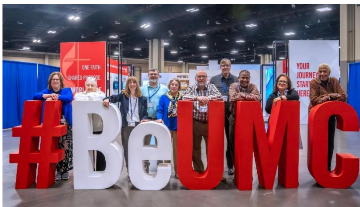
Photo Of Eastern PA Delegates to General Conference 2024