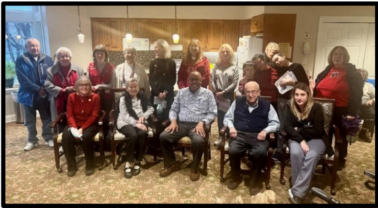
Christmas Caroling at Docks Court, December 10, 2023.