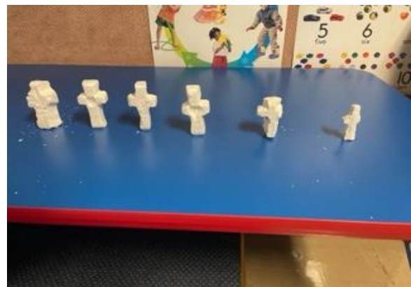
Soap Carvings of the Cross made in Sunday School.