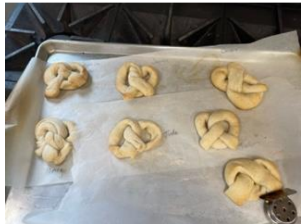
Prayer Pretzels made in Junior Church