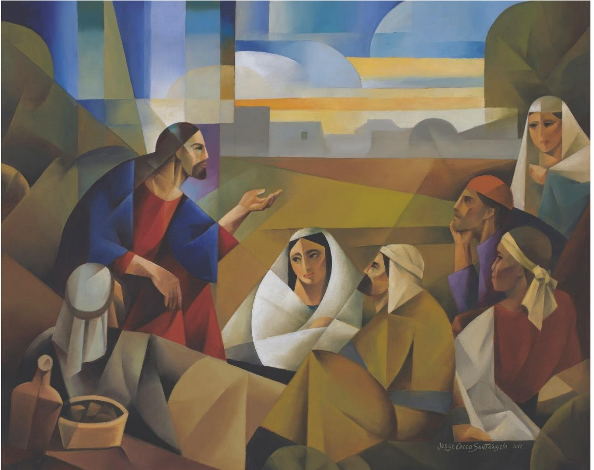
Lord of the Parables, Jorge Cocco (b.1936), Argentina

300 N. Broad Street • Lansdale, PA • 19446